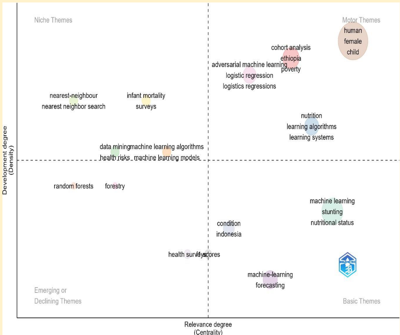
Figure 2. Thematic Map

within the cluster. The highest PageRank value is found for "cohort analysis" (0.005), emphasizing its position as the central topic. Overall, this analysis highlights cohort-based approaches as the central theme in the research, focusing on health, socioeconomic factors, and outcome measurements relevant for understanding stunting.